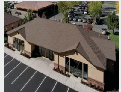
4883 & 4869 W. MALAD STREET OFFICE SPACE FOR SALE OR LEASE