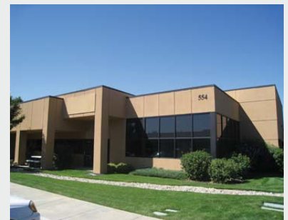
EMERALD CORPORATE PARK OFFICE BUILDING FOR LEASE